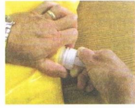
Pouch Preparation #5