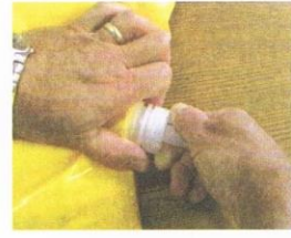
Pouch Preparation #5