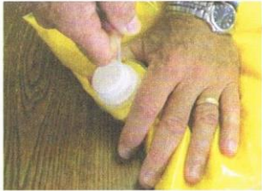
Pouch Preparation # 2